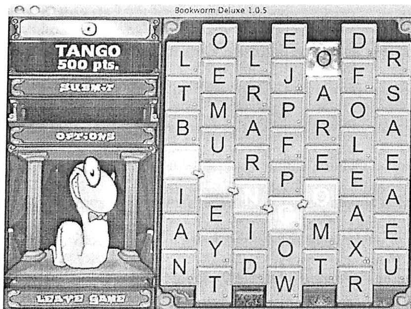
Figure 2.1.1 Bookworm Application

Bookworm is a word search game developed by PopCap Games. It consists of a grid of letters and its objective is to find as many valid words or words that could be found in a standard dictionary as you can. The method of forming the word is through clicking the tiles that are only adjacent or connected. The scoring method is based on the length and on the dot found on every tile. There are also burning tiles that may burn up the entire grid of letters and you could possibly lose the game. To prevent the tiles from burning you have to look for a valid word adjacent to the burning tile in order to put off the flame. This is quite similar to the project we are proposing but, it differs in our project in the sense that it has a definite goal regarding synonyms and antonyms. Instead of looking for valid words, our project aims to provide a list of words and look for it in