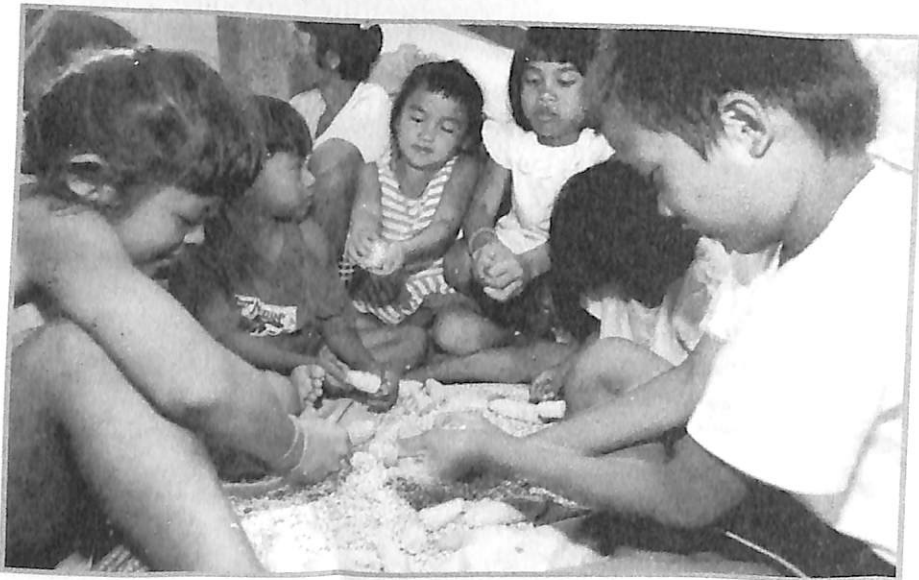
Children prepare corn for cooking at an evacuation center in Maigo.

In the coastal areas where there was electricity, the respondents watched television during free time. In the hinterlands that had yet to have electricity, the younger children played house or hide-and-seek, Chinese garter or marbles, or watched older children play ballgames. Younger children had more time to play because they were not given many domestic responsibilities. They also liked strolling around the neighborhood with their friends. However, there were also children who reported to have been restricted by parents even before conflict came to the community.