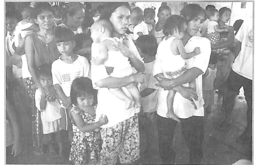
The evacuees inside a schoolhouse in Maigo that was turned into an evacuation center in 2003.

Because it was normal for them to see the MILF elements in their neighborhood, the Munai children did not fear the MILF, unlike the children from Kauswagan and Maigo who disclosed some stereotypes they held about the MILF, as below: