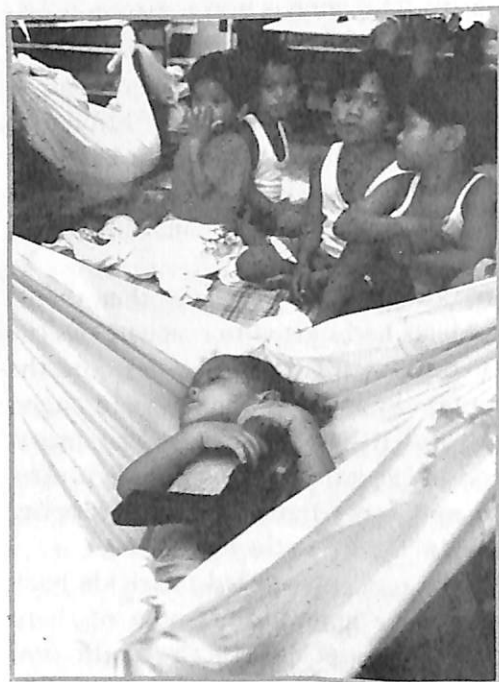
This photo of young children at an evacuation center was taken in 2000 by the late Gene Boyd Lumawag. Photo courtesy of Bobby Timonera

and interviews in Kauswagan and Maigo were done in Cebuano while Tagalog was used with the Maranao 7 children in Munai.