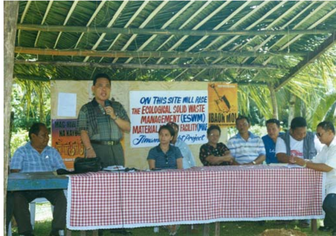
One of the company's pulong-pulong with community members.

Second, imparting entrepreneurial skills and provision of seed capital for engaging in small-scale livelihood projects using a modified approach. For some community programs, a livelihood project became an end in itself but, in the case of the company's Community Development Program, emphasis on livelihood as a way to help emancipate the residents from conditions of poverty was equalized with sectoral coaching to advance social and environmental consciousness by highlighting the correlation between environmental conservation or the proper use of natural resources and community development.