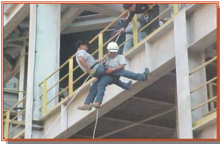
Company employees train in rescue operations in a fire safety drill.