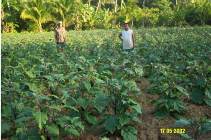
A community livelihood project receives assistance from the company.

First, the meaningful involvement of the impacted communities for example was crucial in harnessing their own capacity for self-development. The rationale was to make the residents know that it is their right to actively participate in activities that will affect their lives and that their own development can be harnessed through concerted effort. Problem identification and the planning of solutions are therefore being done by the communities themselves. It was assumed that social assessment and management would be more effective if communities acquired such a sense of “ownership”. Critical aspects of the assessment and project implementation were therefore not relegated to the effective control of company people.