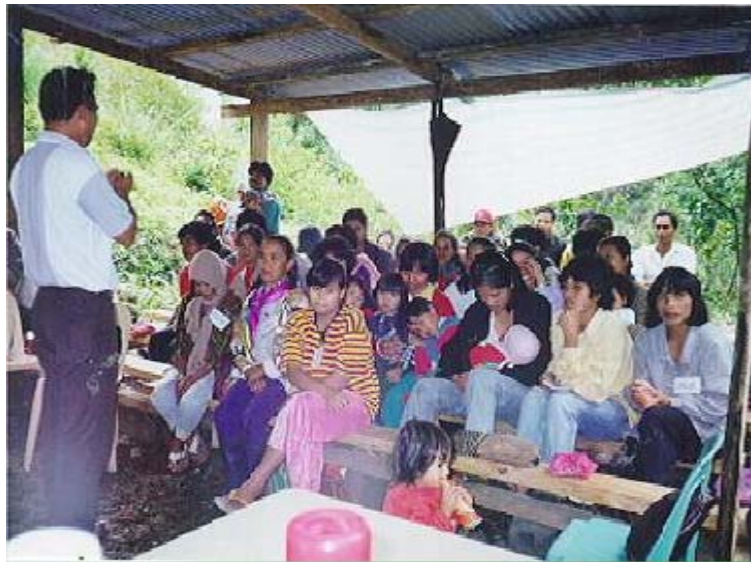
Local residents are consulted about the environmental and community development programs of the company.

From these generally shared elements, Philex's corporate citizenship policy tends to cluster around three inter-related components: a commitment to social empowerment, protection of the environment, and economic efficiency. Its conceptualization of corporate social responsibility advances clear-cut prescriptions for dealing with natural resource use and community and stakeholder engagement. Thus the need to protect the environment is inextricably linked to relationship building with impacted communities, government agencies, people's organizations and civil society groups.