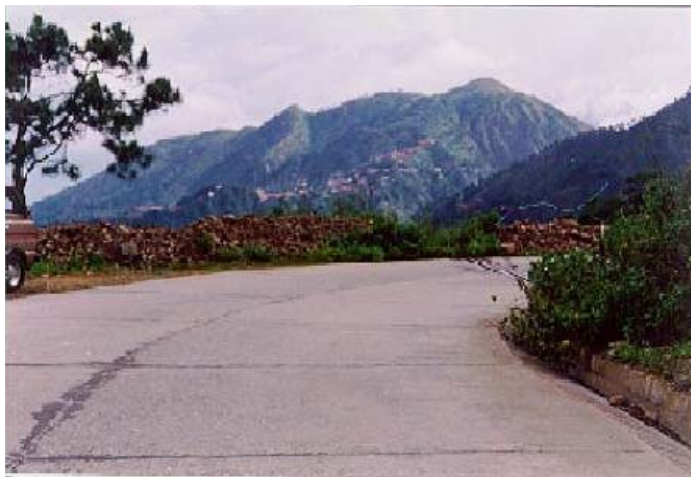
Feeder roads are constructed to facilitate the transport of goods and services to neighboring towns and communities.