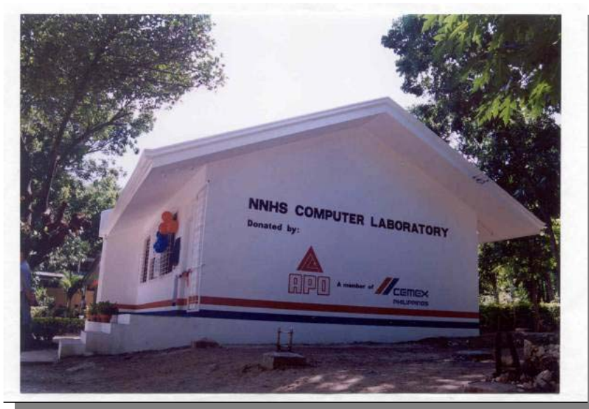
Naga National High School, one of the company's Adopt-A-School projects, receives a school building for computer training.