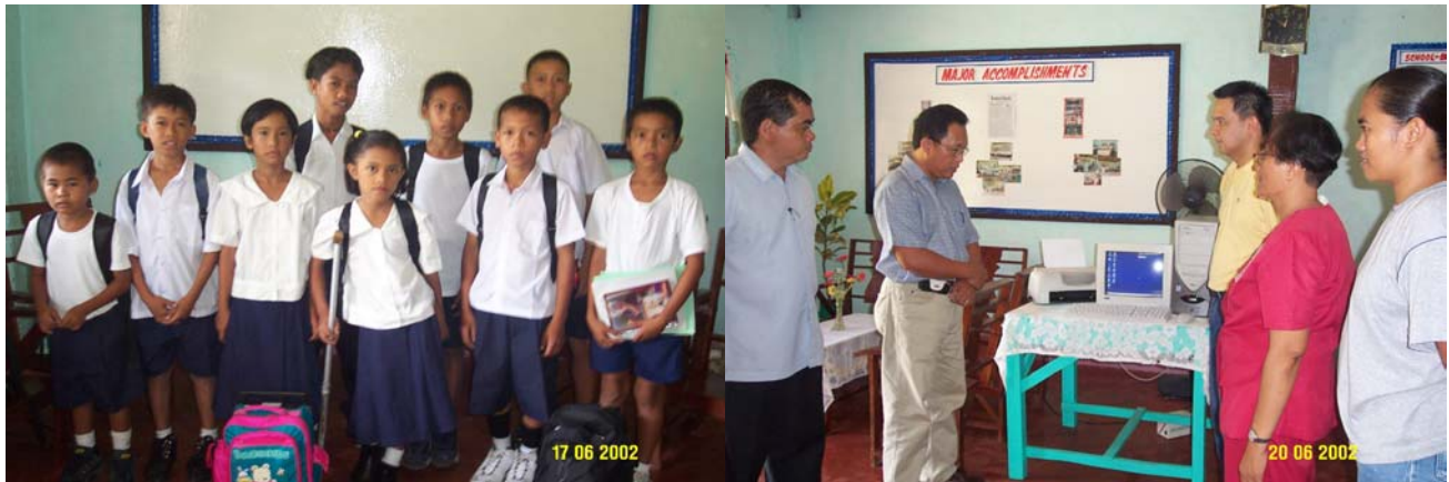
Left: Scholars of the company get free elementary education and other assistance from the company. Right: Silangan Exploration Inc. donates computer facilities to schools in the community.