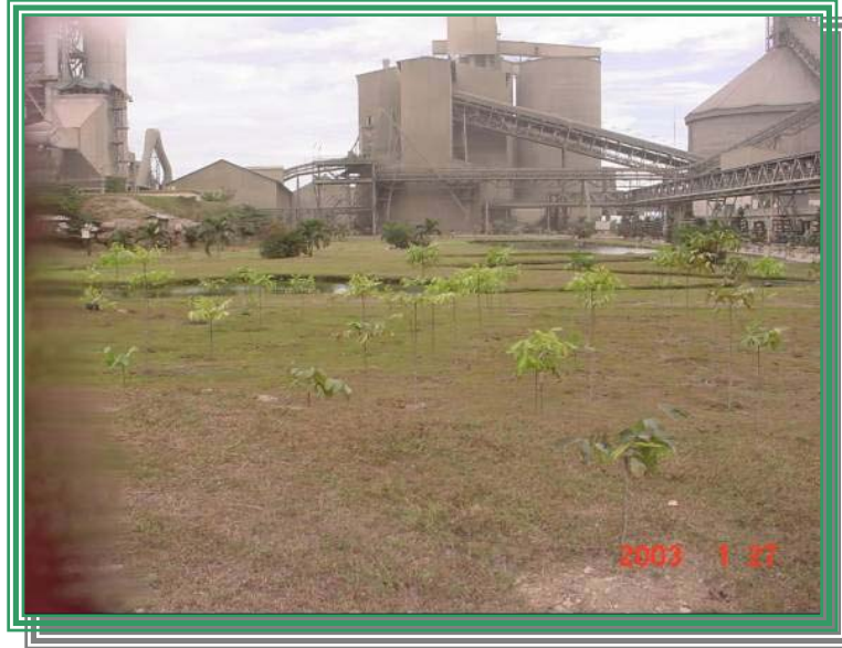
APO conducts environmental protection and enhancement program through tree planting projects.

The company considers its social responsibility as more than just giving donations and grants. The company believes that it should “operate our plants and facilities in a manner that preserves the environment and protects the health and safety of our employees and the public”. This commitment finds expression of its corporate social responsibility in the following policy statements: