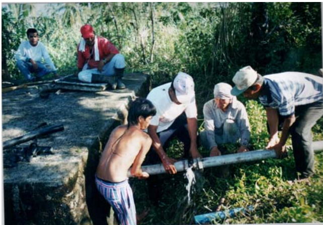
Water improvement system project in Barangay San Isidro assisted by members of the Community Technical Working Group (CTWG).

Working through its community relations arm, the company full-heartedly supported the creation of the Community Technical Working Group (CTWG) as recommended and initiated by the Mines and