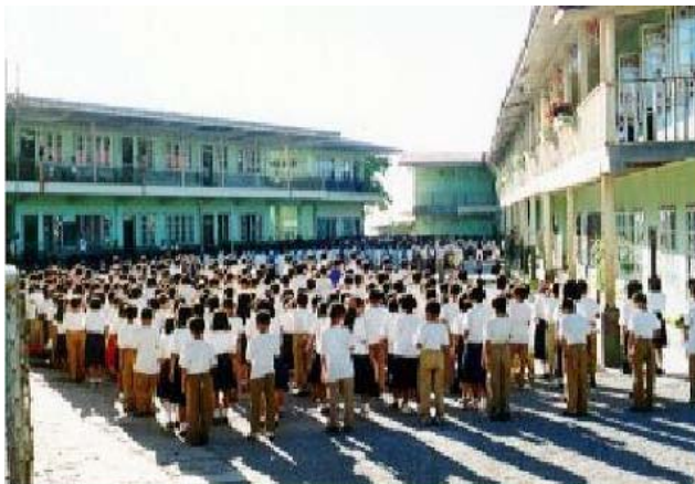
The company provides free elementary education and a heavily subsidized high school education for the dependents of employees and for the students from neighboring communities.