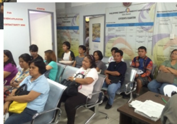
Charity patients wait for the release of their guarantee letters at the PCSO Iloilo Branch Office.