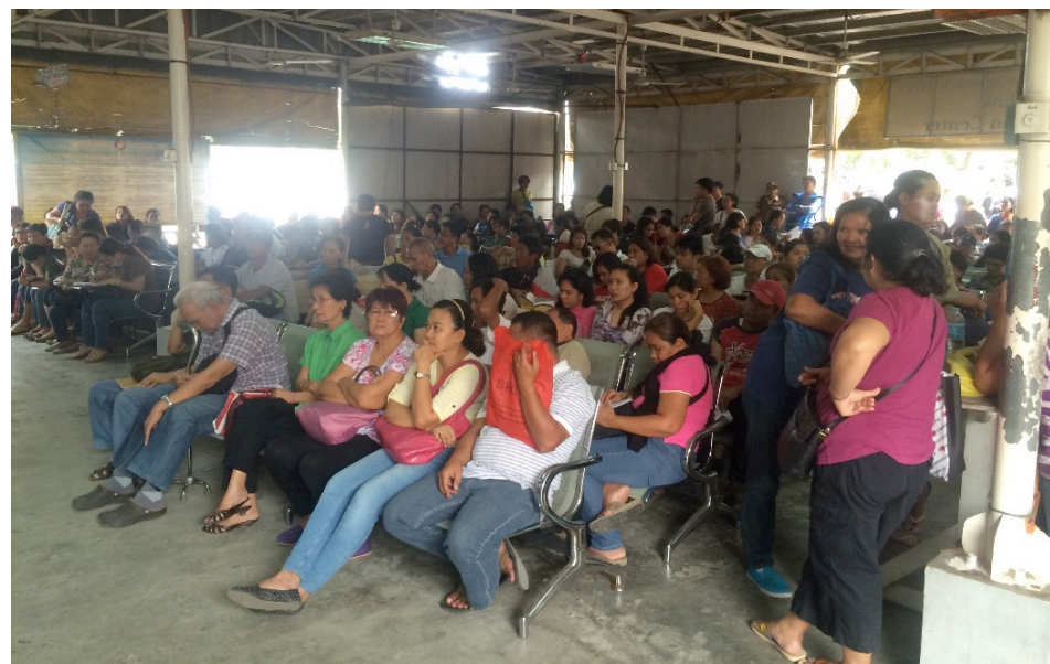
People patiently wait for their IMAP to be processed by PCSO employees at the Lung Center of the Philippines (LCP).