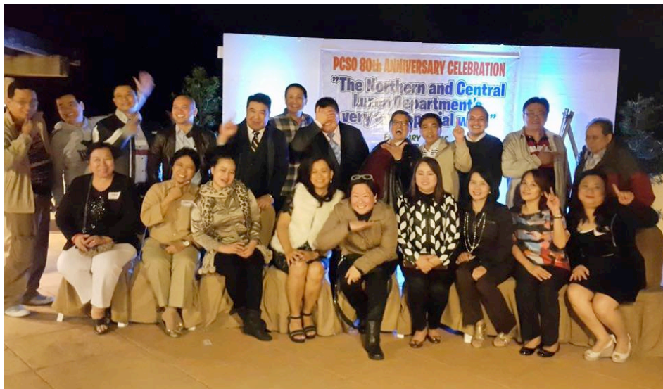
Ang PCSO Board kasama ang matataas na opisyaes ng ahensya at mga Managers ng NCL Department