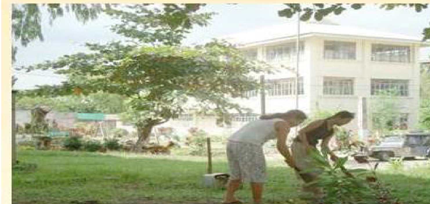
Marillac Hills premises