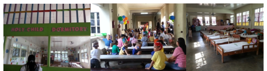
White Cross Children's Home provides temporary shelter and home life services to abandoned and neglected children

White Cross Children's Home can accommodate 150 children at a time but usually maintains 100 to 120 because of its limited resources. It has six dormitories and categorized according to age group: Cherubim Dorm (0 – 1 year old), St. Joseph Dorm (1 – 2 years old), Holy Angel Dorm (2 – 3 years old), Holy Child Dorm (3 – 4 years old), Milagrosa Dorm (4 -6 years old girls) and St. Vincent de Paul Dorm (4 -6 years old boys). It also has a day care facility for children ages 2.5 to 5 years from the depressed areas of San Juan. To date, White Cross is a home