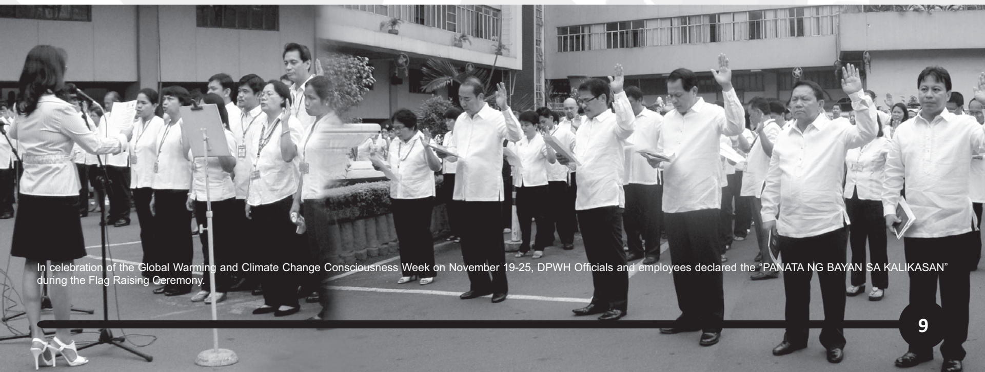
In celebration of the Global Warming and Climate Change Consciousness Week on November 19-25, DPWH Officials and employees declared the “PANATA NG BAYAN SA KALIKASAN” during the Flag Raising Ceremony.