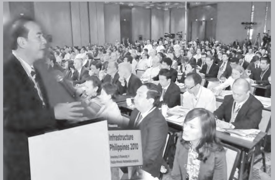
Secretary Rogelio L. Singson gives a birds eye view of the DPWH strategic direction in line with President Aquino's program of doing much needed infrastructure to attain sustained and high economic growth for the country during the "Infrastructure Philippines 2010: Investing & Financing in Public-Private Partnership Projects" held November 18, 2010 at Marriott Hotel, Pasay City