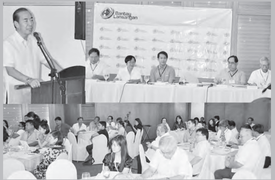
SINGSON KEYNOTES BANTAY LANSANGAN GENERAL ASSEMBLY. DPWH Secretary Rogelio L. Singson delivers his speech before guests and participants of the Bantay Lansangan annual general assembly held at Ortigas, Pasig City. Bantay lansangan is a road project monitoring program jointly implemented by World Bank, DPWH, and Non-government Organization and road sector stakeholders.