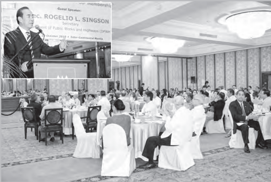
RIGHT PROJECTS AT THE RIGHT COST AND RIGHT QUALITY. Secretary Rogelio L. Singson presents to members of the Management Association of the Philippines (MAP), the country's leading management organization, his DPWH transformation program and initiatives aim at doing the right projects at the right cost and the right quality. He also discusses at the MAP General Membership meeting held at Intercontinental Manila Public-Private Partnership initiatives that include the development of expressways within 200 kilometer radius of Metro Manila and planned performance based road maintenance contracts to ensure quality national roads.