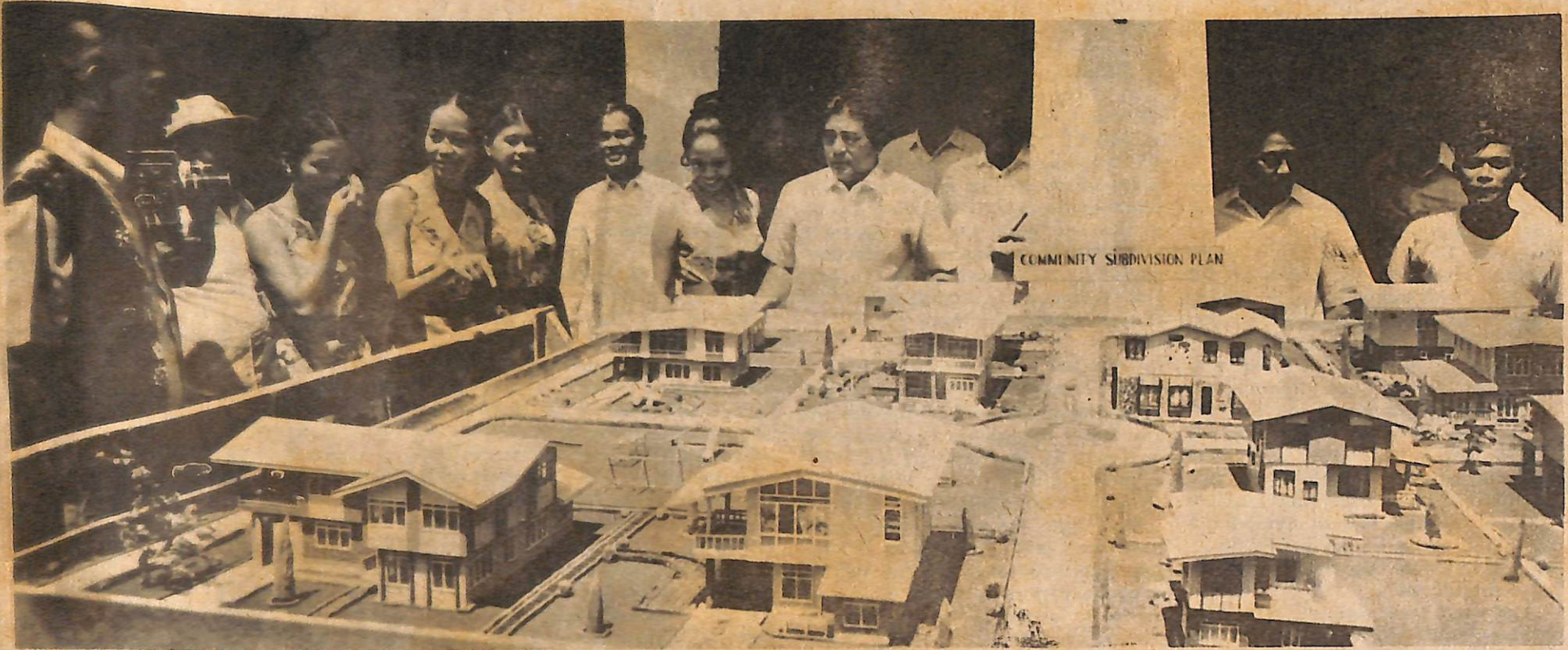
TABLE SCALE MODEL OF DAVAO CITY'S COMMUNITY SUBDIVISION PLAN Mayor Lopez has ambitious plans for expansion.

tations, what used to be the single province of Davao was divided into three separate provinces, namely, Davao del Norte, Davao Oriental, and Davao del Sur.