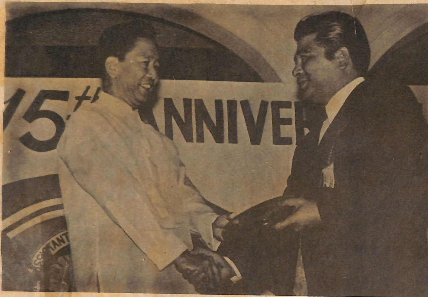
"MOST OUTSTANDING CITY MAYOR OF THE YEAR" For three successive years.