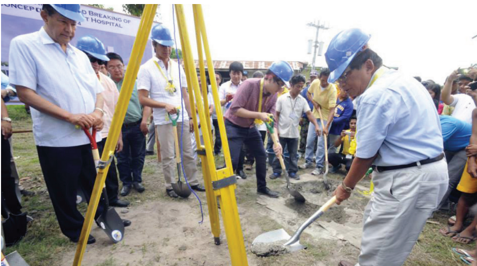
NEW DISTRICT HOSPITAL Senator Bam Aquino and Sec. Ona lead the launching and groundbreaking ceremony of the Concepcion District Hospital last May 3 in Concepcion, Tarlac