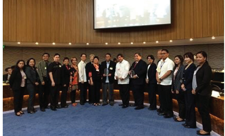
PH SIN TAX REFORM The Southeast Asia Tobacco Control Alliance (SEATCA) gave an award to the Philippine Government for its sin tax reform during the World Health Organization (WHO) Regional (ASEAN) Workshop on Tobacco Taxation and Illicit Trade on May 22-23, in Manila.