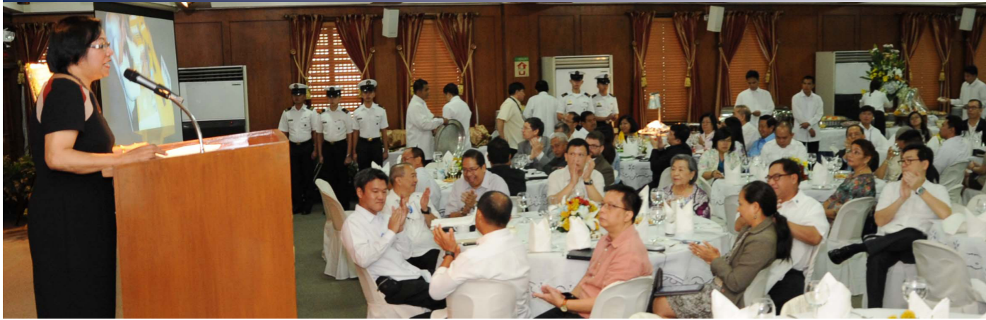
MARKING A NEW MARITIME MILESTONE. Labor and Employment Secretary Rosalinda Dimapilis-Baldoz (left) recognizes the efforts of all tripartite partners for the success of the Maritime Labor Convention (MLC), 2006 Entry into Force to promote descent work and ensure protection of Filipino seafarers. The ceremony was held at the AMOSUP Convention Hall, Seamen's Center Building, Intramuros, Manila.