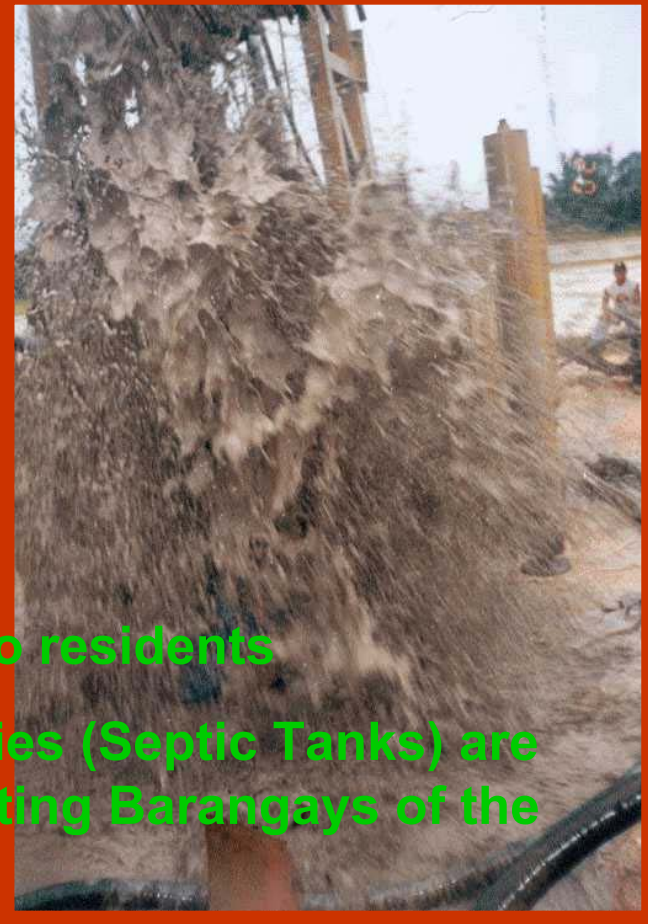
Right Photo: Water Supply Development (Well Drilling)