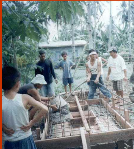
Middle Photo: Excreta Disposal Facilities (Septic Tanks) are provided in 10 participating Barangays of the Province of Palawan