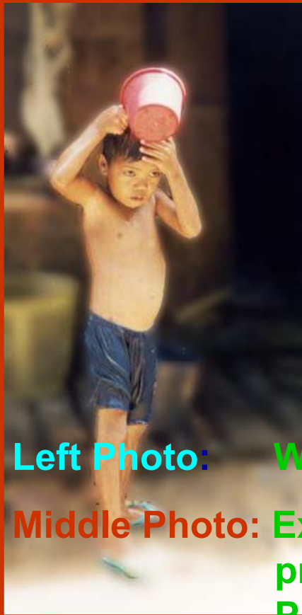
Left Photo: Water supply for Panabo residents