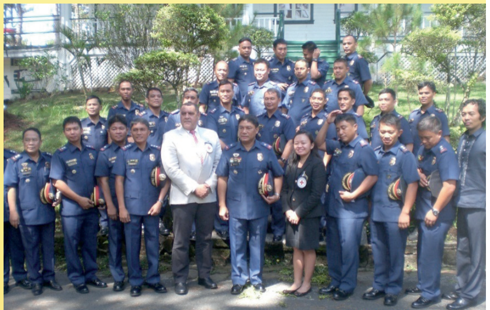
The participants from the Special Action Force and Regional/Provincial Public Safety Battalions of PROs 1, 2 and 3 with the guests

Meanwhile, the 2nd, 3rd, 4th and 5th Legs of the series of trainings will be held in August, September and October 2014 in Naga City, Cagayan De Oro, Boracay and Iloilo, respectively.