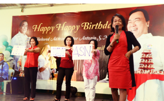
HRD doing their part