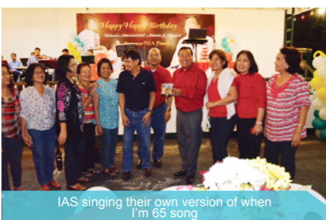
IAS singing their own version of when I'm 65 song