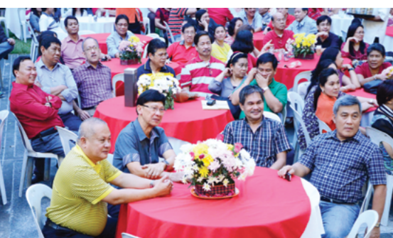
RIMs/PMs/OMs celebrates with Admin Nangel