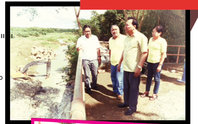
STRAIGHT FROM THE TOP

"Itataas namin kayo, itataas niyo rin kami," was the message he left with the farmers.