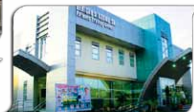
UPRIS Farmers' Training Center