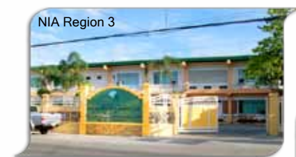
NIA Region 3