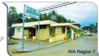
NIA Region 7