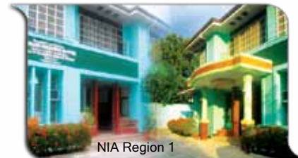
NIA Region 1