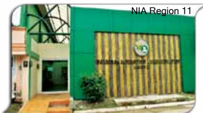
NIA Region 11