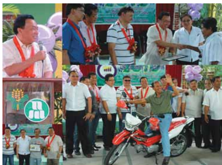
Irrigators' Association Organization Summary as of December 2010

Basic Leadership Development and Financial Management and System Management Training were conducted in 20,735 irrigation beneficiaries. Orientation Training was conducted for 4,856 staff-members.