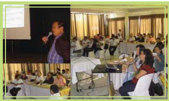
The IAS Department Manager on his presentation of the IAS Mission and Vision during the Exit Conference at General Santos City Region 12 on October 12, 2010

Maintained close coordination with Department of Budget and Management on matters related to organization and management.