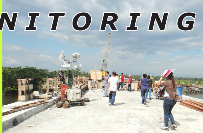
Construction of Matampay Bridge along Cotabato City Access Road.