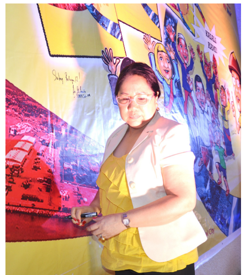
South Cotabato Province Governor Fuentes after she affixed her signature on the RDP Launching tarpaulin as a sign of support to the Plan.