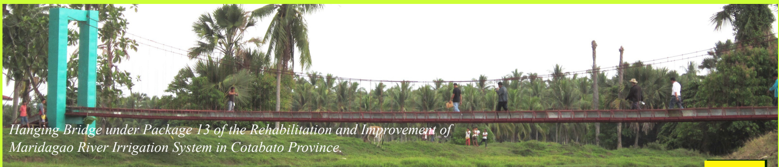
Hanging Bridge under Package 13 of the Rehabilitation and Improvement of Maridagao River Irrigation System in Cotabato Province.