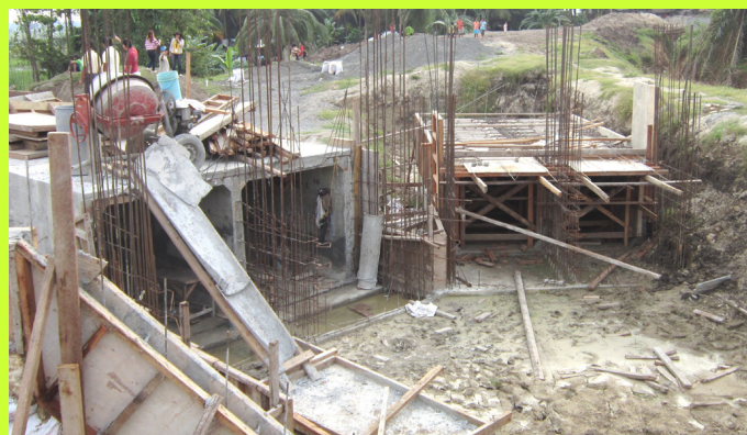
Construction of the head gate of the Right Main Canal Extension 2 under the CY 2012 PhP391 Million Budget of the Malitubog-Maridagao Irrigation Project (MMIP) II.