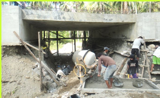
Completion of permanent bridge along Senator Ninoy Aquino-Lebak-Kalamansig Road.