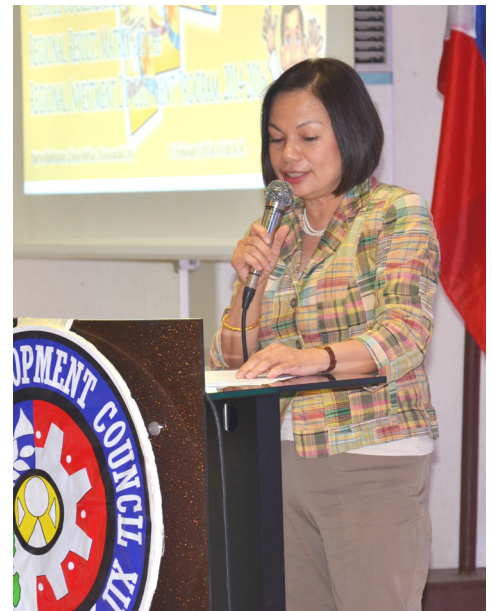
DDG Songco stressed the importance of updating the RDP, which was undertaken parallel with the PDP.

A total of 175 RDC XII members, officials and representatives of