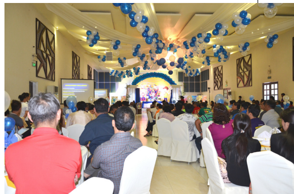
View from the back. The Launching was attended by RLAs, SUCs, Private HEIs, NGOs and members of media.